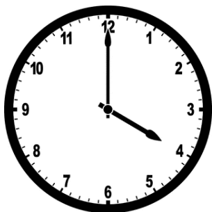
Samples at Laboratory before 4:00pm